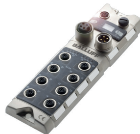
Network module for connecting to the controller